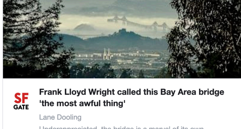
Frank Lloyd Wright called this Bay Area bridge "the most awful thing." Underappreciated, the bridge is a marvel of its own.